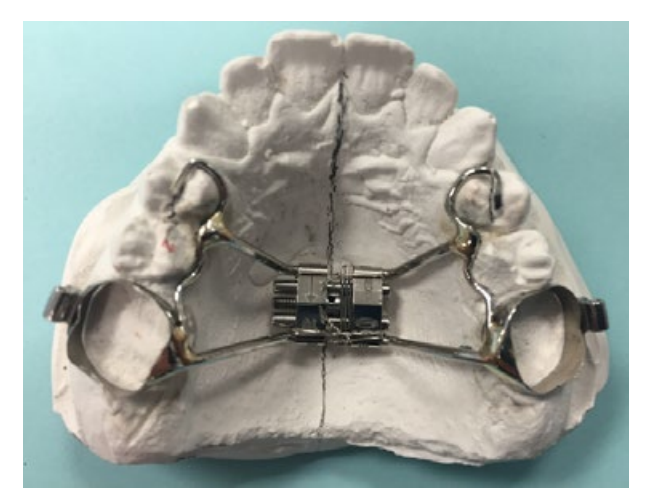
Figure 1. Standardized Ni-Ti MLSAE appliance design including mesial extension arms

Upon delivery, all appliances were evaluated to ensure proper design and pre-activation by one author (KM). Once cemented, the ligatures holding the compressed Ni-Ti leafs were cut. Each patient was seen approximately one week after insertion to ensure that there were no issues with the appliance. Each patient was then seen one month post-delivery and then at monthly intervals when the treating doctor