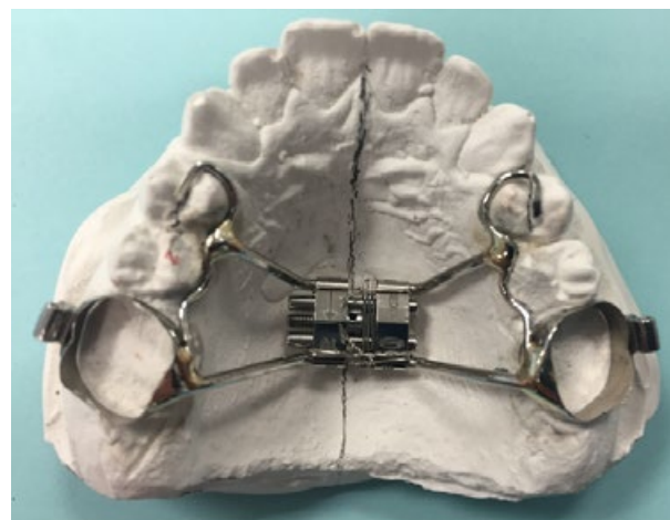
Figure 1. Standardized Ni-Ti MLSAE appliance design including mesial extension arms

Upon delivery, all appliances were evaluated to ensure proper design and pre-activation by one author (KM). Once cemented, the ligatures holding the compressed Ni-Ti leafs were cut. Each patient was seen approximately one week after insertion to ensure that there were no issues with the appliance. Each patient was then seen one month post-delivery and then at monthly intervals when the treating doctor